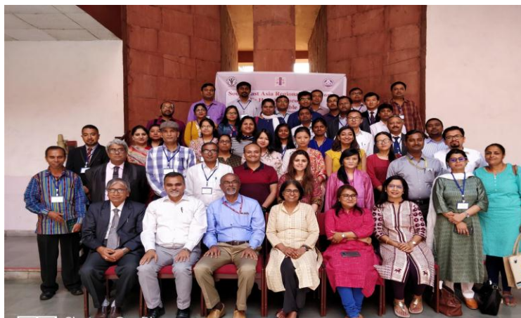
Picture : 4 th PGIMER-AIIMS SEAR course on Public Health on 20 th to 24 th March 2018

Chandigarh and World NCD Federation jointly organized a five day South East Asia Regional Course on Public Health Approaches to Non Communicable Diseases (NCDs) from 20th to 24th March, 2018 in Delhi. National and International Faculty participated. The focus of the course was to sensitize and enable programme managers & academicians to use public health approaches to NCD prevention & control in the South East Asia region. There were a total of 47 participants that included International and National participants. A total of 37 guest faculty speakers facilitated the course and included experts from AIIMS, PGI, Ministry of Health, ICMR, WHO and other important institutions.